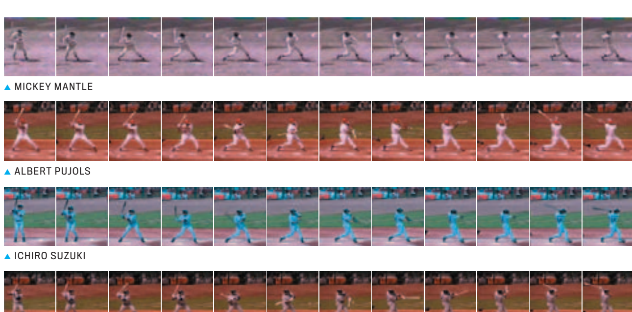
★ From Don Slaught's copious files, footage showing that every great batter, regardless of his initial stance, looks virtually the same.

compromises" power development. Endurance training, he says, "interferes with strength and power gains unequivocally." But baseball continues to advocate mile runs and seventy-pound biceps curls, and every spring we see pictures of groups of ballplayers lumbering through their train-